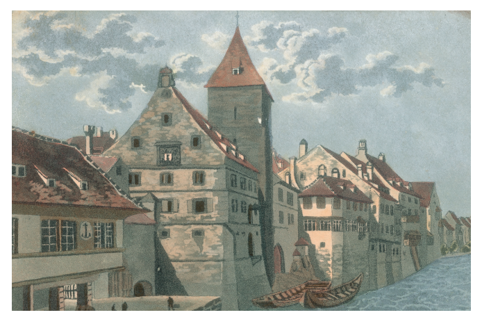
View of the Salzhaus and Salzturm from Schifflände. Behind it the Inn of the Three Kings (before 1830).

The first official record of the "Three Kings" or "At the Three Kings" at Blumenrain 8 in Basel dates back to 1681. The hostelry is located close to the main water and overland trade and travel routes directly at Schifflände.