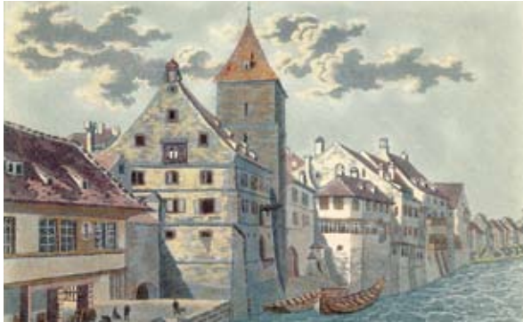
View of the Salzhaus and Salzturm from Schiffflände. Behind it the Inn of the Three Kings (before 1830).

The first official record of the “Three Kings” or “At the Three Kings” at Blumenrain 8 in Basel dates back to 1681. The hostelry is located close to the main water and overland trade and travel routes directly at Schiffflände.