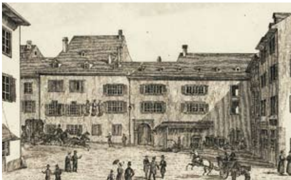
View of the old inn with the three figures representing the kings, after 1833.

Three kings is a popular name for inns and taverns located near trade routes. It is a reference to the three wise men from the Orient: Caspar, Melchior and Balthasar, also known as the Three Kings.