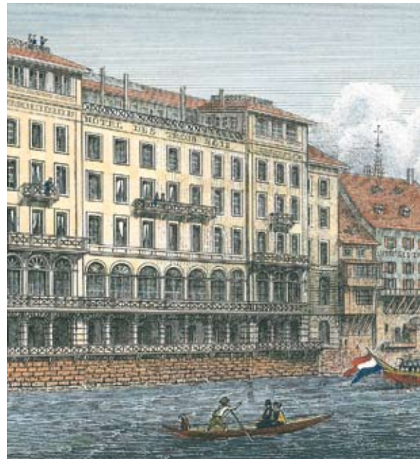
View of the hotel in 1844.