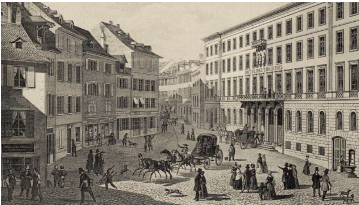
View of the hotel in 1844.